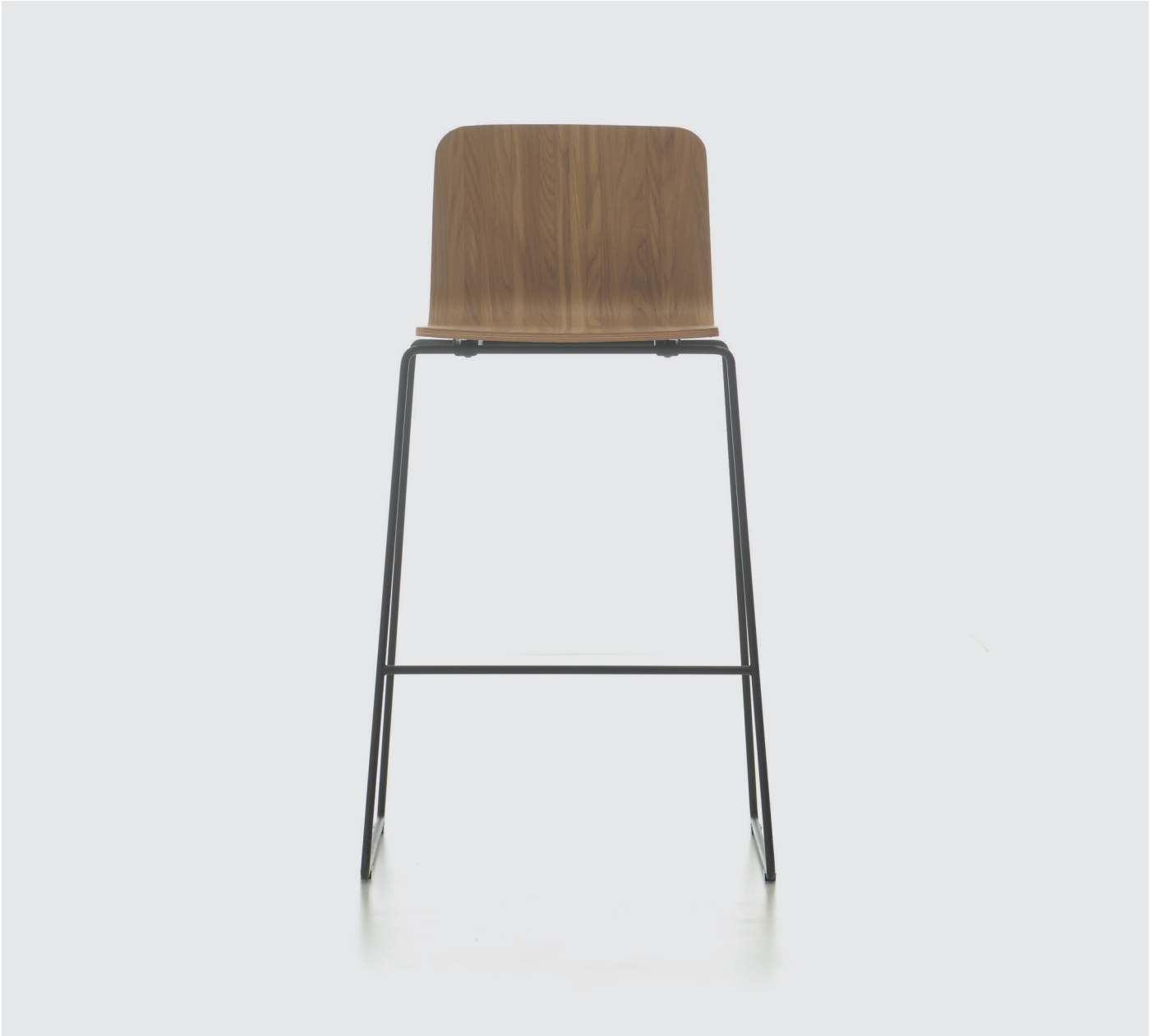
Eon Bar Stool